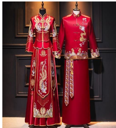
Figure 2. Chinese Bridal Fashion