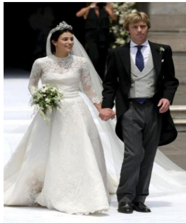
Figure 1. Western Culture Bridal Fashion

While the design of eastern culture bridal fashion has a variety of characteristics according to the country as follows: