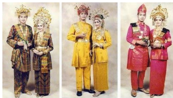
Figure 5. Malay Bridal Fashion.